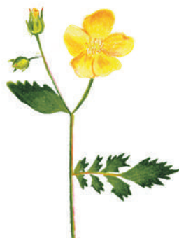
Leafy Cinquefoil Drymocallis fissa

“Cinquefoil” means “five leaves,” although the leaves are not always divided into five leaflets. The leaves usually have a pleasantly fuzzy feel.