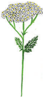
Yarrow Achillea lanulosa

You can help protect wildflowers. Take home pictures instead of bouquets so that park wildflowers will produce seeds for the future, and park wildlife will have access to the food and habitat they need. Stay on designated trails to preserve areas with sensitive species. Also, consider joining the Open Space and Mountain Parks Native Plant Conservation Volunteer Program to help us maintain our native plant gardens, battle invasive plants, and educate the public.