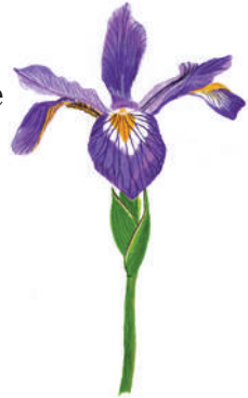
Wild Iris Iris missouriensis

Drink in that gorgeous color for a minute.