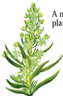
Monument Plant Fraseria speciosa

A monument plant in bloom is cause for celebration. These plants grow for up to 60 years, bloom once, and then die.