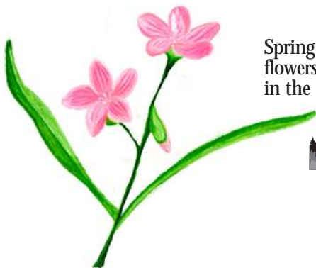
Spring Beauty Claytonia rosea

Spring beauty is one of the earliest-blooming flowers. A similar species also grows in forests in the East.