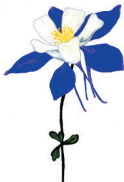
Colorado Columbine Aquilegia coerulea

The blue found in a columbine changes depending on where you are. The farther north, west, or higher in elevation you travel, the lighter the blue is supposed to become. Do your observations follow these trends?