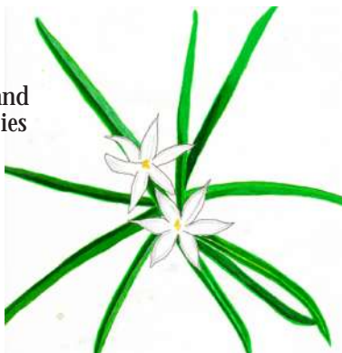
Sand Lily Leucocrinum montanum

Can you see how the flowers are attached to the rest of the plant?