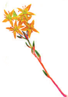
Stonecrop Amerosedum lanceolatum

Feel the waxy leaves, and take a close look at the tiny, star-shaped flowers.