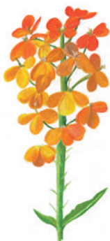
Western Wallflower Erysimum asperum

Mustard comes from the crushed seeds of plants closely related to wallflowers.