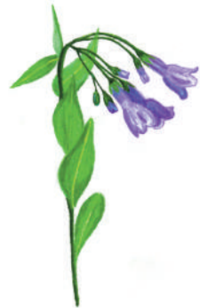
Lance-leaved Chiming Bells Mertensia lanceolata

The flowers of chiming bells usually aren't just blue. Look for other colors in the buds.