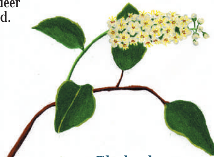
Chokecherry Padus virginiana ssp. melanocarpa

Take a close look at the cherries. Chokecherry pits may often be found inside scat (animal droppings). Look for tent caterpillars in the branches.