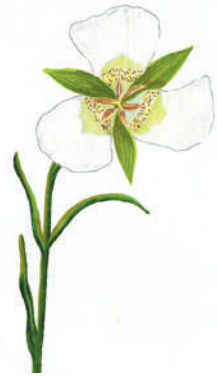
Mariposa Lily Calochortus gunnisonii

These flowers are even more beautiful on the inside. Take a close look at all of the colors hidden there.