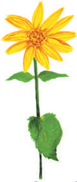
Heart-leaved Arnica Arnica cordifolia