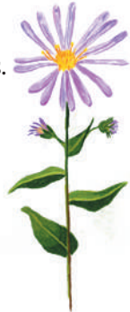
Aster Aster spp.

Look closely. Each “flower” is actually made up of many tiny flowers. The yellow flowers in the center are called disk flowers. Each one of the purple petals represents a different ray flower.