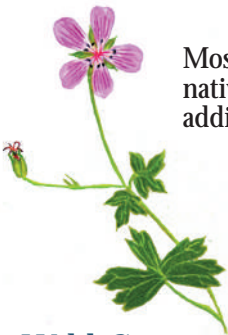
Wild Geranium Geranium caespitosum ssp. caespitosum

Most potted geraniums come from South Africa. Our native geraniums flower year after year, making wonderful additions to gardens.