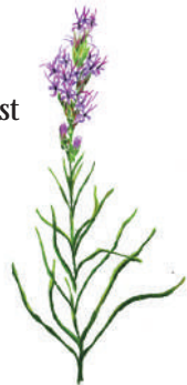
Blazing Star Liatris punctata

The scientific name contains the word “punctata,” meaning “dotted.” Look for tiny dots on the leaves.