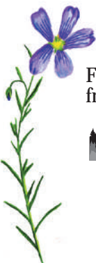
Blue Flax Adenolinum lewisii

Flax has been used for fiber since ancient times. Linen is made from flax stems cured in water.